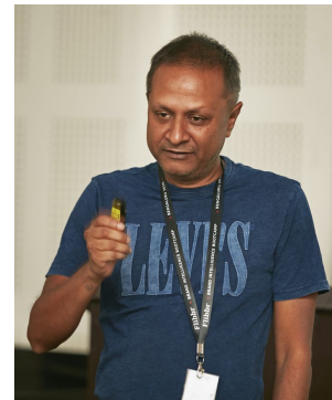
At the bootcamp